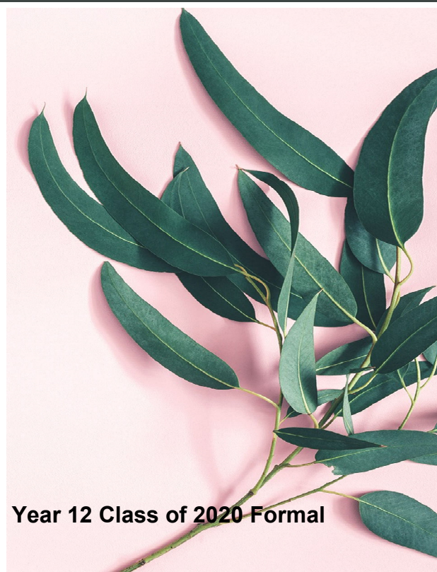
Year 12 Class of 2020 Formal