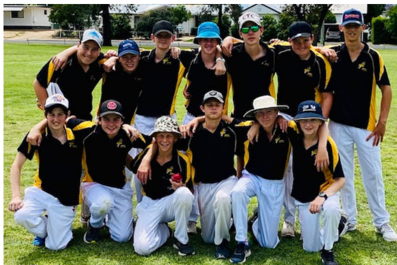
U14s Boys Cricket Team