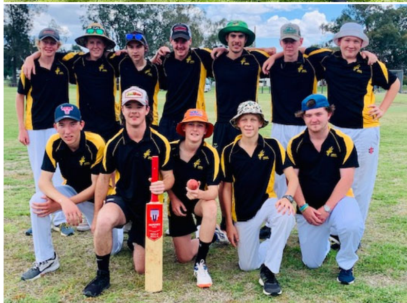
Open Boys Cricket Team