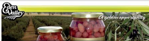
TABLE OLIVES 1KG $13

EXTRA VIRGIN (COLD PRESSED) OLIVE OIL 500ML $10